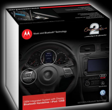
Bluetooth Kit Packaging